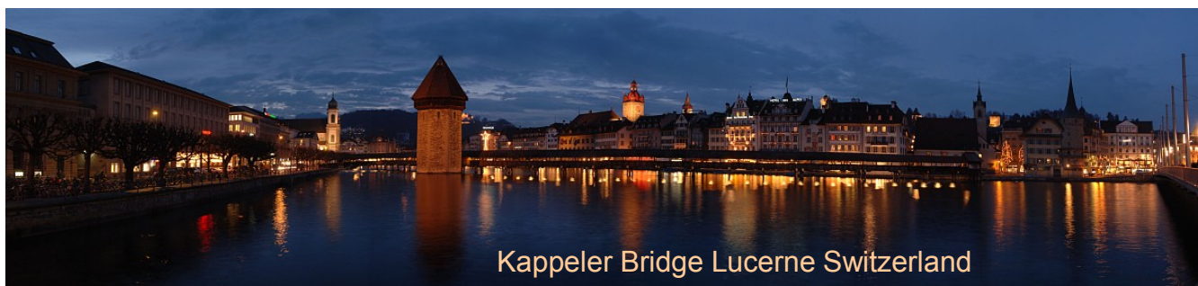
Kappeler Bridge Lucerne Switzerland